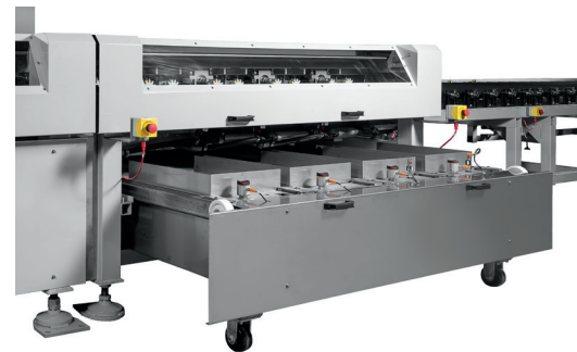
Roll Out Tank Cart